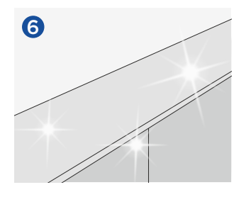
Wipe away with a clean cloth. For food preparation areas, rinse thoroughly with clean water. Leave the surface to air dry.