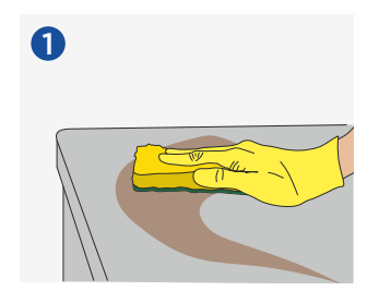
CLEAN: Use GermiSan Plus to clean the surface*.