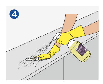
DISINFECT: Cover the surface with diluted GermiSan Plus.